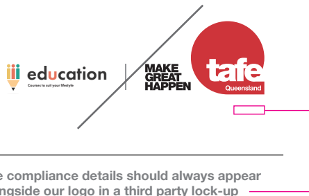
The compliance details should always appear alongside our logo in a third party lock-up