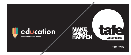
The Q-device should not be altered