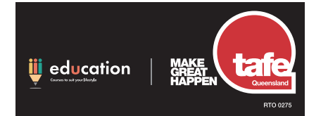
Approved third party logo lock-up application - Reversed