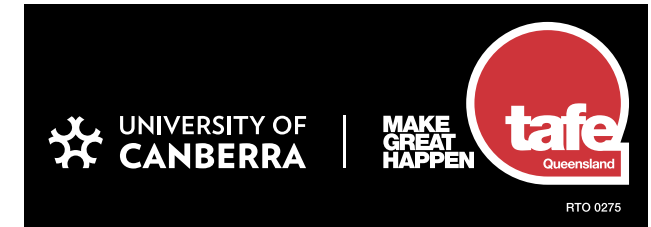
TAFE Queensland third party logo lock-up applied - Reversed