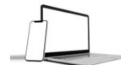
Production 8000/stock.adobe.com. Used with permission